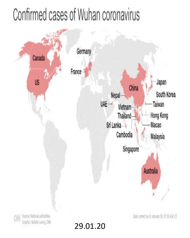
Confirmed cases of Wuhan coronavirus